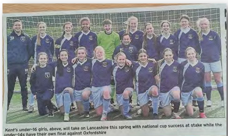
Kent's under-16 girls, above, will take on Lancashire this spring with national cup success at stake while the under-14s have their own final against Oxfordshire