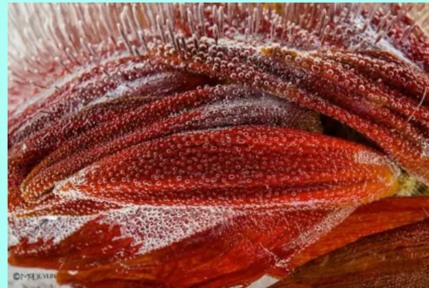
Mesmerizing Photos of Frozen Flowers by Mo Devlin

When you hear the term flower photography, it probably doesn't inspire a particularly powerful reaction. There are plenty of gorgeous images of flowers