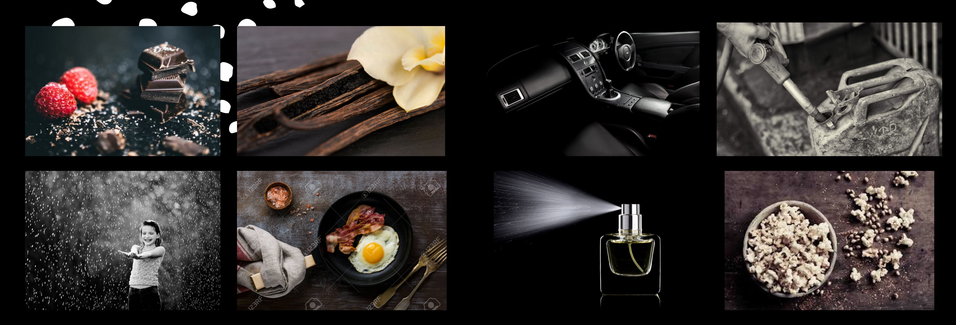
YOUR TASK IS TO TAKE PHOTOGRAPHS OF OBJECTS THAT GIVE OFF A DISTINCTIVE, FAMILIAR SMELL. THE IMAGES CAN BE OF THE SUBJECTS BY THEMSELVES, OR YOU CAN INCLUDE PEOPLE IN THEM TOO. USE YOUR CAMERA/PHONE. (WHATEVER YOU HAVE ACCESS TO).

THESE SHOULD BE PRESENTED ON CANVA ALONGSIDE ANNOTATIONS WHICH EXPLAIN AND EXPLORE YOUR IDEAS. TO SUBMIT YOUR WORK YOU SHOULD SHARE THE DESIGN WITH HBOX@FULSTONMANOR.KENT.SCH.UK PLEASE LET ME KNOW IF YOU HAVE ANY ISSUES.