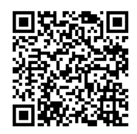
Scan the QR code or <u>click here</u> to view and download our Attendance Policy

No holidays are authorised during term time. We do expect to be informed if parents and carers have booked a holiday.