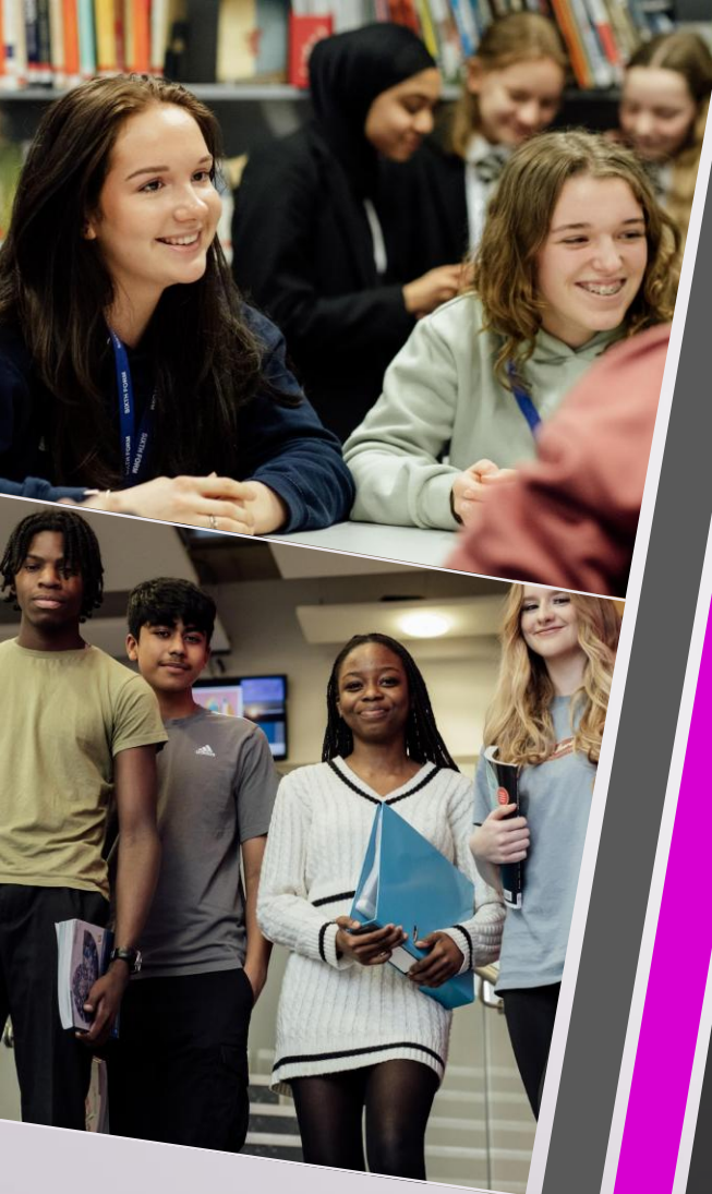
Year 12 Example